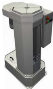
Model TT 4-24

This is a plug and play machine, designed for fast simple operator setup and changeover. At less than 2000 lbs, the machine is easy to relocate, and requires no special foundation, pit, or operator stand. This is the perfect cell machine.