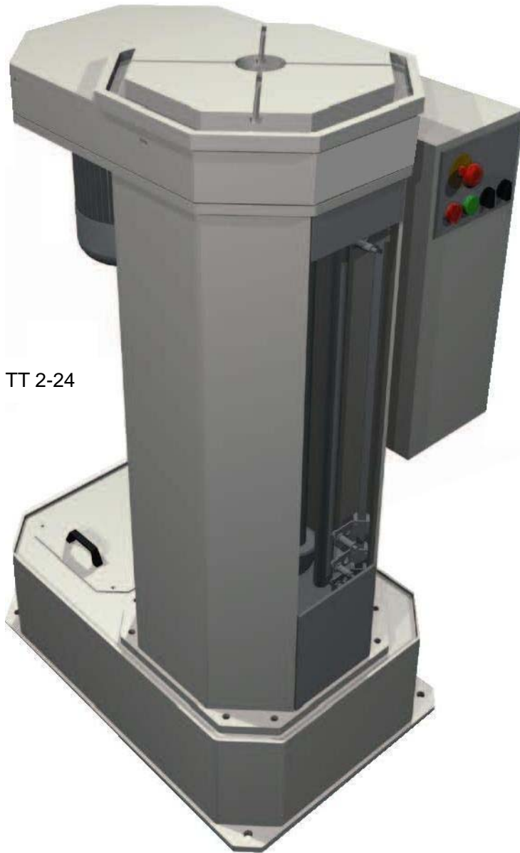
Model TT 2-24