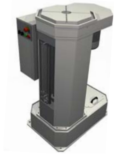
Model TT 4-24

Small – Quiet – Simple – Efficient – Electromechanical