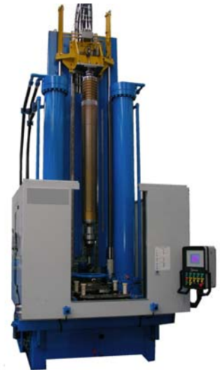
Model T50-100 50 Ton 100 Inch