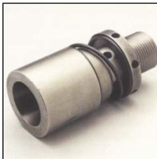
Standard Pullers for Simple Operation