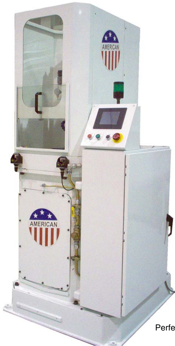
Table Top Broaching Machine w/Detent Auto Retriever (Automatic Broach Tool Handling)

Perfect for Keyways, Internal Splines, or Forms