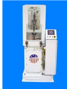
Table Top "Special" w/ Detent Retriever Unit