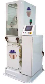
Model TT-SP 6-24

Small – Quiet – Simple – Efficient – Electromechanical