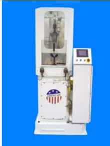
Model TT SP 2-24

This is a plug and play machine, designed for fast simple operator setup and changeover. At less than 2000 lbs, the machine is easy to relocate, and requires no special foundation, pit, or operator stand. This is the perfect cell machine.