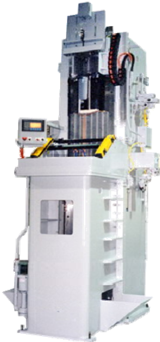
Model VPD 35-72

Customized to Any Application – Narrow to Wide – One to Six Stations