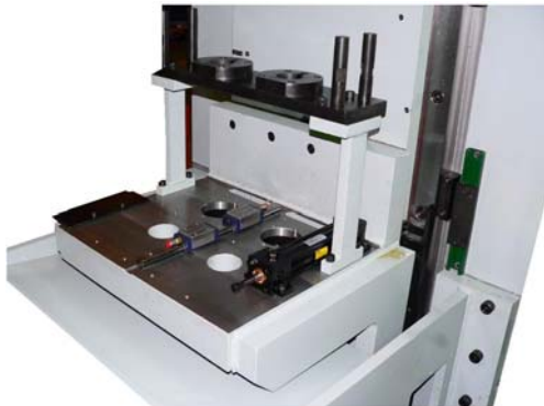
Single or Multi-Station Lifting Tables

Broaching parts to close tolerances and with excellent surface finish can be accomplished only with a very rigid machine. The American design has a heavy duty single piece column and a knee that extends to the floor resulting in a very strong machine. The large hardened and ground guide ways, and laser aligned, hand scraped way beds, provide long life and a smoother broaching operation with world class accuracy.