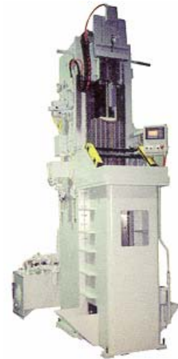
VPD 25 Ton 72 Inch Stroke

Engineered Weldment & Solid Cast Iron Components